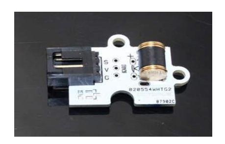
Fig.2.2 Vibration Detection Sensor

This is a type of sensor which senses the vibration levels. It will inform the door to lock if any unwanted vibration is caused by the customer. The information will be send through the IoT.