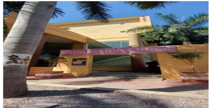
Fig.1 RRIT Civil & Mechanical Block

Modern sustainable design goes beyond material selection and includes strategies such as water conservation, waste management, pollution reduction, and the integration of renewable energy systems. Educational institutions, in particular, have a significant responsibility in demonstrating sustainable practices, as their built environment directly influences students and future professionals. Implementing such strategies not only minimizes environmental impact but also promotes awareness and responsible engineering practices. A structured assessment of the buildings helps identify both strengths and performance gaps, especially in areas like ventilation, energy optimization, and water management. Established frameworks such as GRIHA, LEED, and the Sustainable Development Goals provide standardized benchmarks for evaluation.